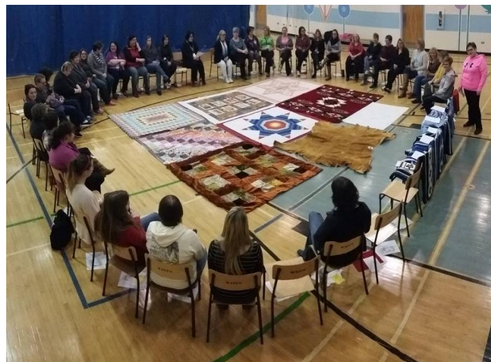
Whispering Hills Elementary School Professional Development day, Athabasca, AB

The Blanket Exercise experience itself takes about 30 to 40 minutes and should always be followed by a 1 or 2 hour talking circle. (Depending on the participant numbers). This discussion is key to the process as it gives the participants the opportunity to express thoughts, share feelings and ask questions about the experience. The session is 2-3 hours total (depending on talk back) and requires little to no interruption. There is usually no break as coming and going disrupts the flow of events.