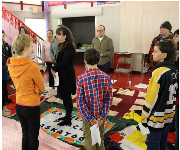
Education Day, Youth Centre, Calling Lake, AB

These discussions often raise deep emotions and we strongly encourage you to work with your head, heart, and spirit whenever doing the Blanket Exercise. Wherever possible (and it almost always is) please invite local Indigenous, Métis or Inuit individuals or representatives to be with you: to honour the traditional territory, to teach, and to begin to build a relationship.