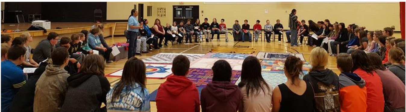
Thorhild Central School, JR/Sr High, Thorhild, AB