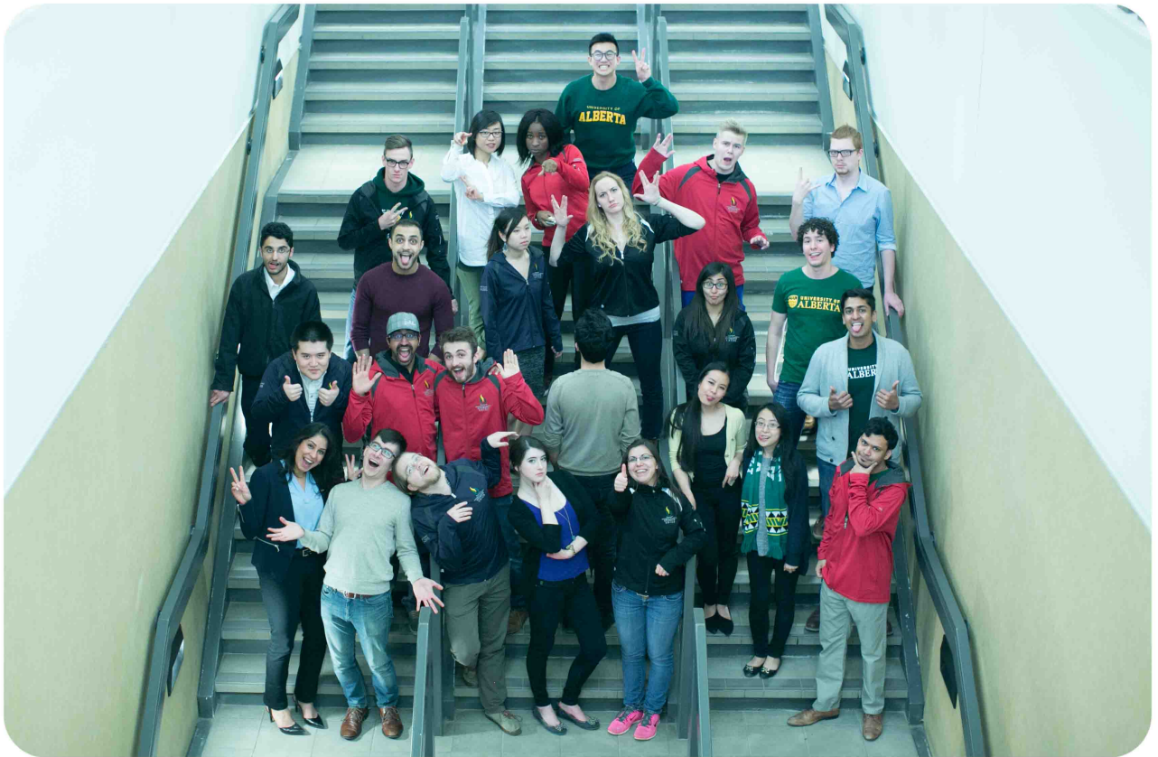
UASU Students' Council being UASU Students' Council.

Here we are, at our final Council meeting for the year. Look at yourselves, such a beautiful bunch. I've learned a lot from all of you (and you probably don't even know it), and I'm genuinely curious where all of us will be in ten years. I'll leave it to our dear CAC chair to plan a reunion then.